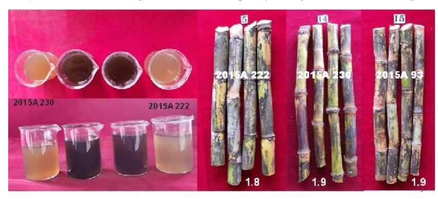
Fig. 2. Evaluation of sugarcane clones based on Colour intensity.